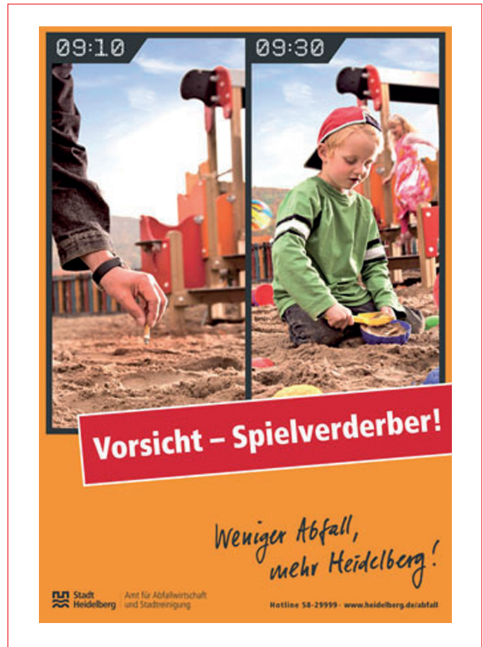
Figure 3: Poster campaign for playground cleanliness in Heidelberg: “Watch out – spoilsports! Less rubbish, more Heidelberg!”