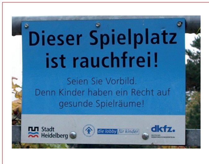
Figure 2: No smoking sign in a Heidelberg playground: “This is a non-smoking playground. Set a good example. Children have the right to play in a healthy area!”

Our findings show that a ban on smoking in playgrounds is only effective if it is communicated through appropriate measures (such as signs or campaigns). Primarily through these no smoking signs or posters are smokers thus reminded of their responsibilities towards children when they are in a playground.