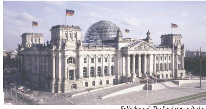
Fully flagged: The Reichstag in Berlin

January 2003: The National Ethics Council approves genetic testing on fertilized oocytes under strict regulations. EU ministers of finance initiate a formal sanctions procedure against Germany for failing to comply with the financial stability agreement.