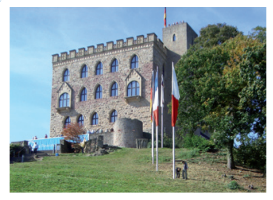
Hambach castle is not only well known because of the political events in the early 19<sup>th</sup> century with great impact for German history, but also impresses by its beautiful location amongst vineyards and small villages.

It was a perfect sunny morning in late September, when we loaded up on the buses. I got a window seat and soaked up the view of the German countryside, thick forests, farm lands, even an old cottage with a water wheel. Our destination was the Hambach castle on the side of a mountain in the heart of wine country close to France. Ever since I was a little kid I have regarded castles as magic places with noble knights and fair maidens of days gone by. The first thing I noticed about the castle was the bronze sculpture of partridges serving as handles of the main entrance. The view from the castle perimeter was vast, we could see various hamlets separated by vineyards and tree-lined roads, the major landmarks being the churches whose steeples rose up like needles from the surrounding red-roofed houses.